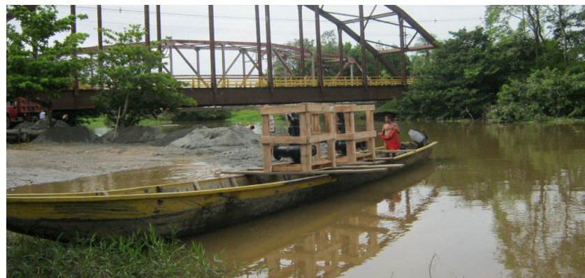
BANANA BOATS WERE USED TO TRANSPORT THE PUMPS ACROSS THE RIVER