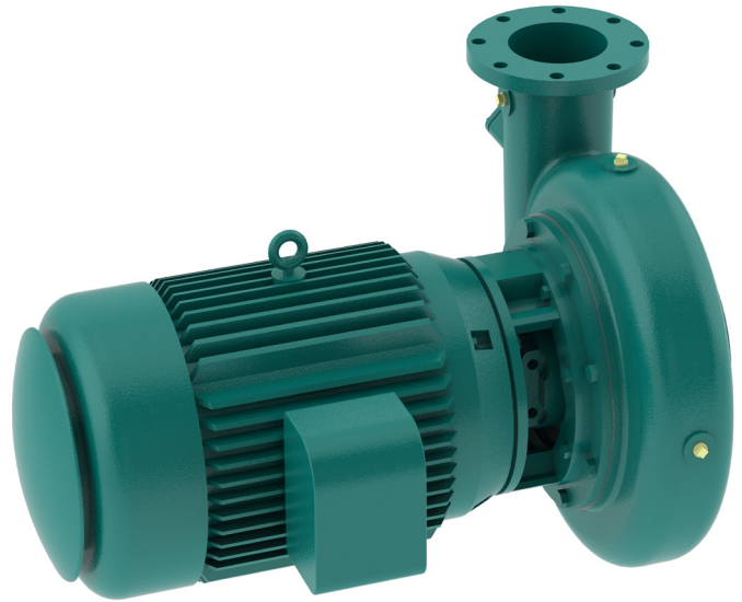
A typical picture of the pump is shown. Please contact Cornell Pump Company for further details. All information is approximate and for general guidance only.